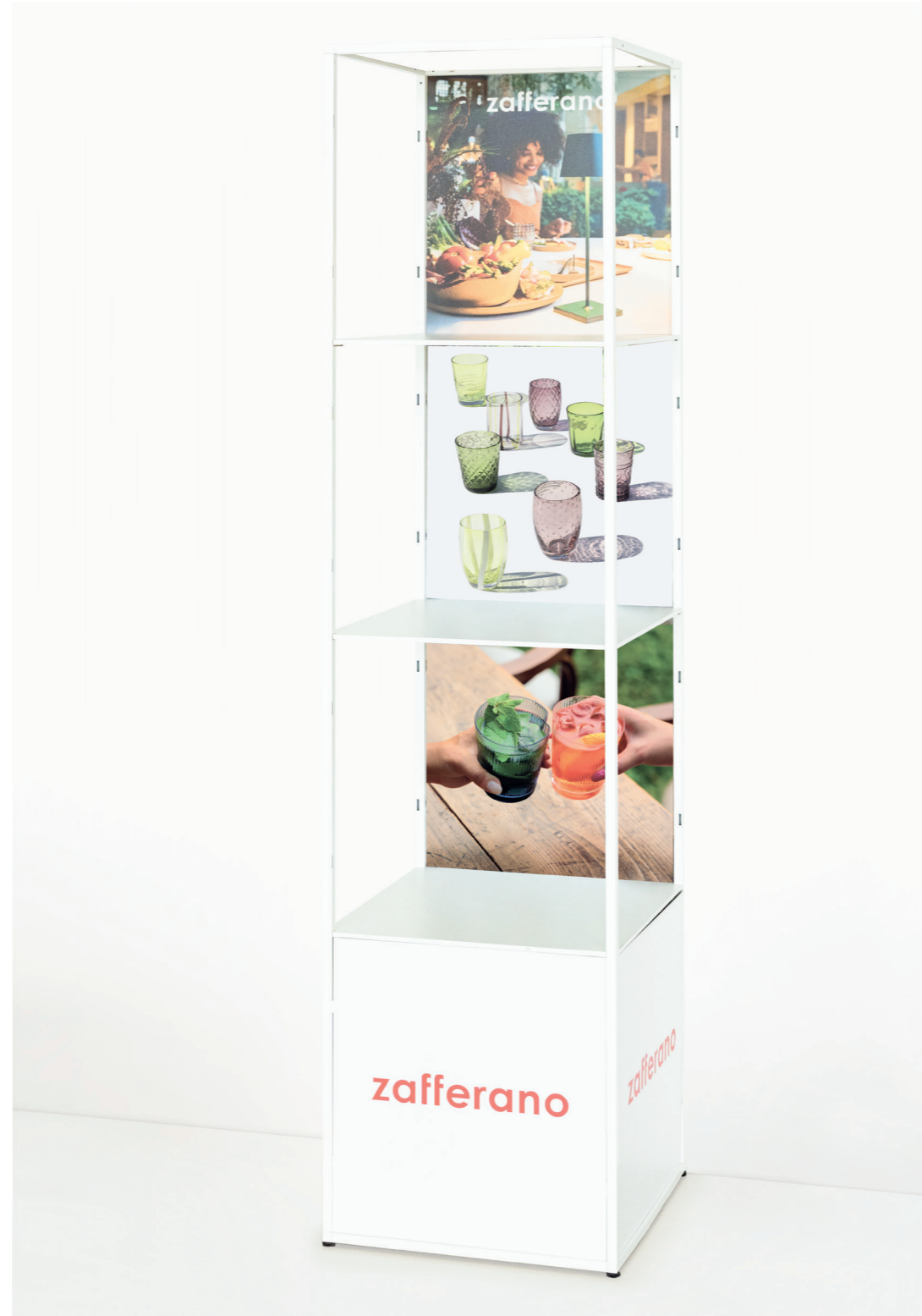
Visual - side 1