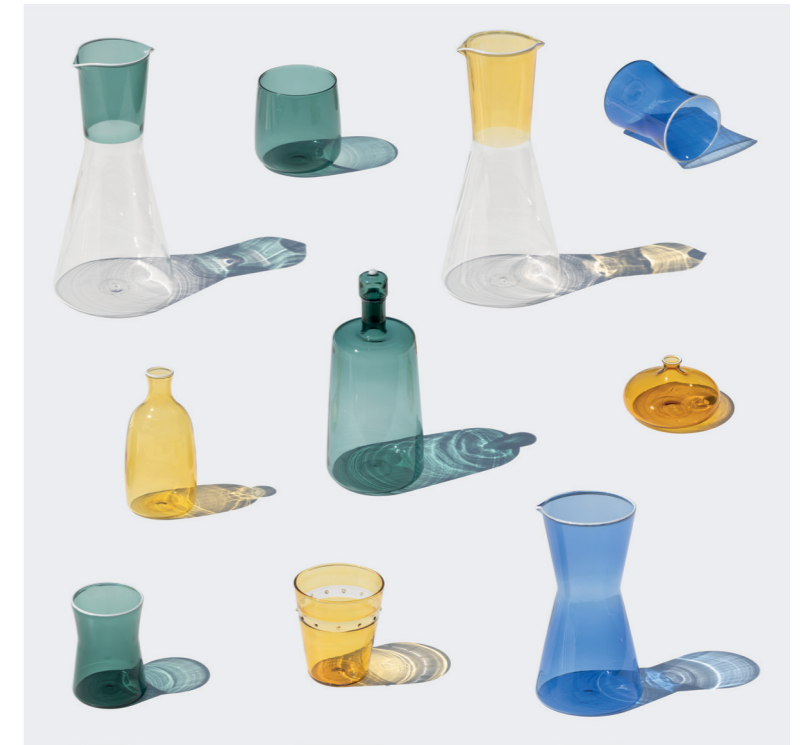
Visual - side 2