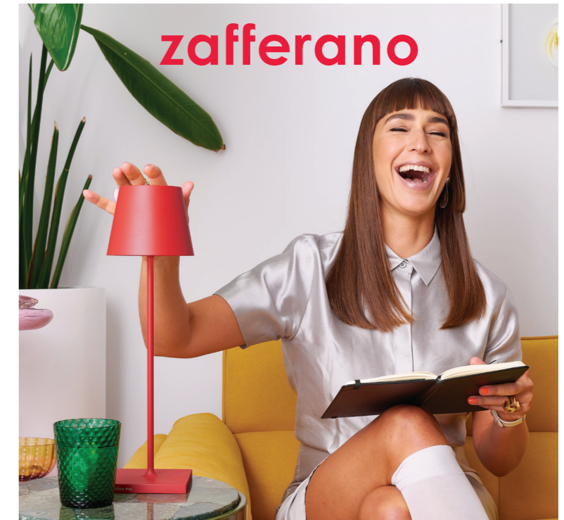
Visual - side 2