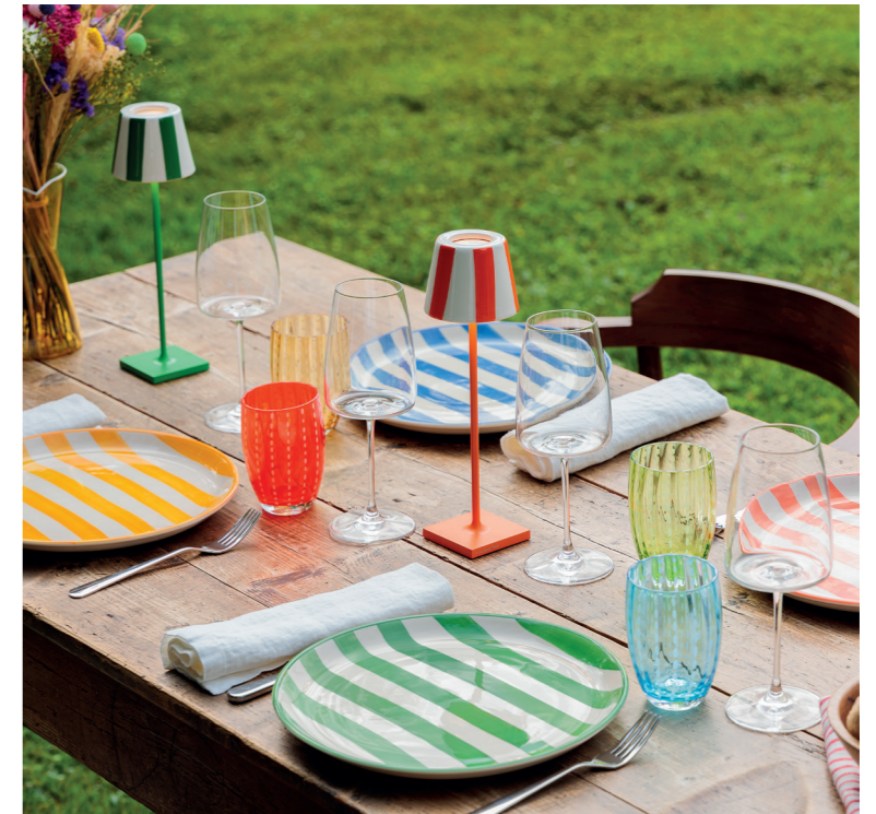
Visual - side 2