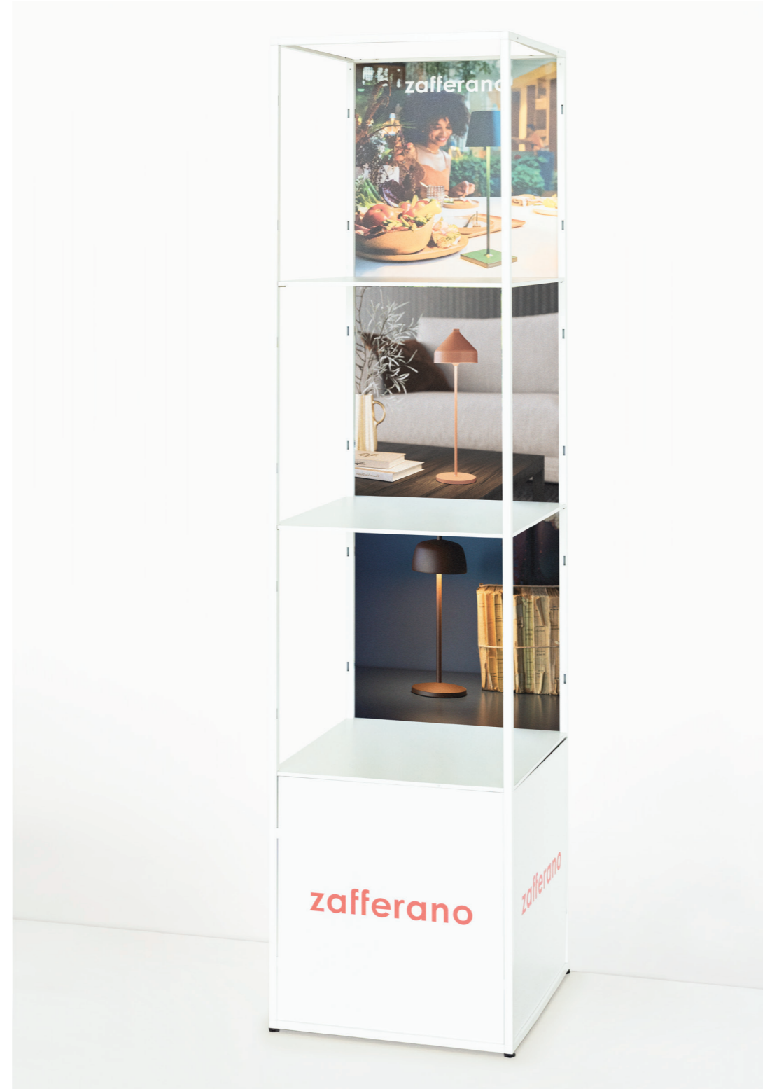
Visual - side 1