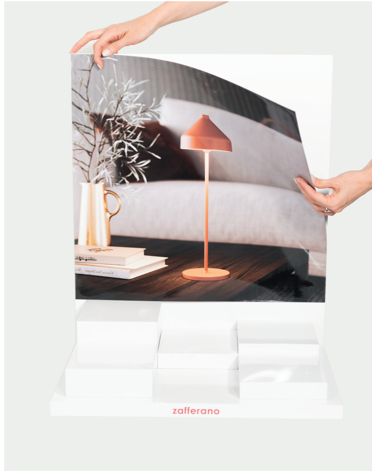
Visual - side 1

The display can also be used without the magnetic Visual Insert, ensuring maximum versatility.