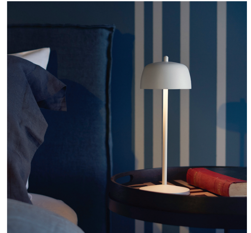
Visual - side 2