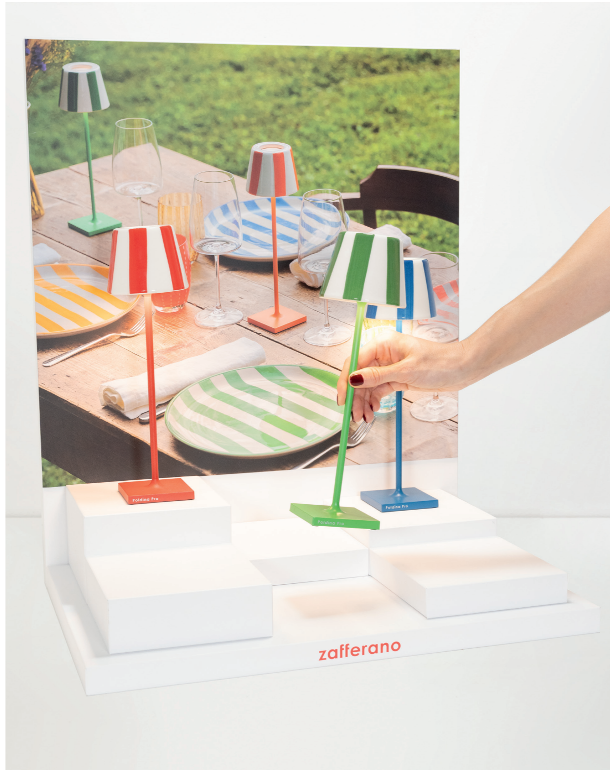
Visual - side 1

The display can also be used without the magnetic Visual Insert, ensuring maximum versatility.