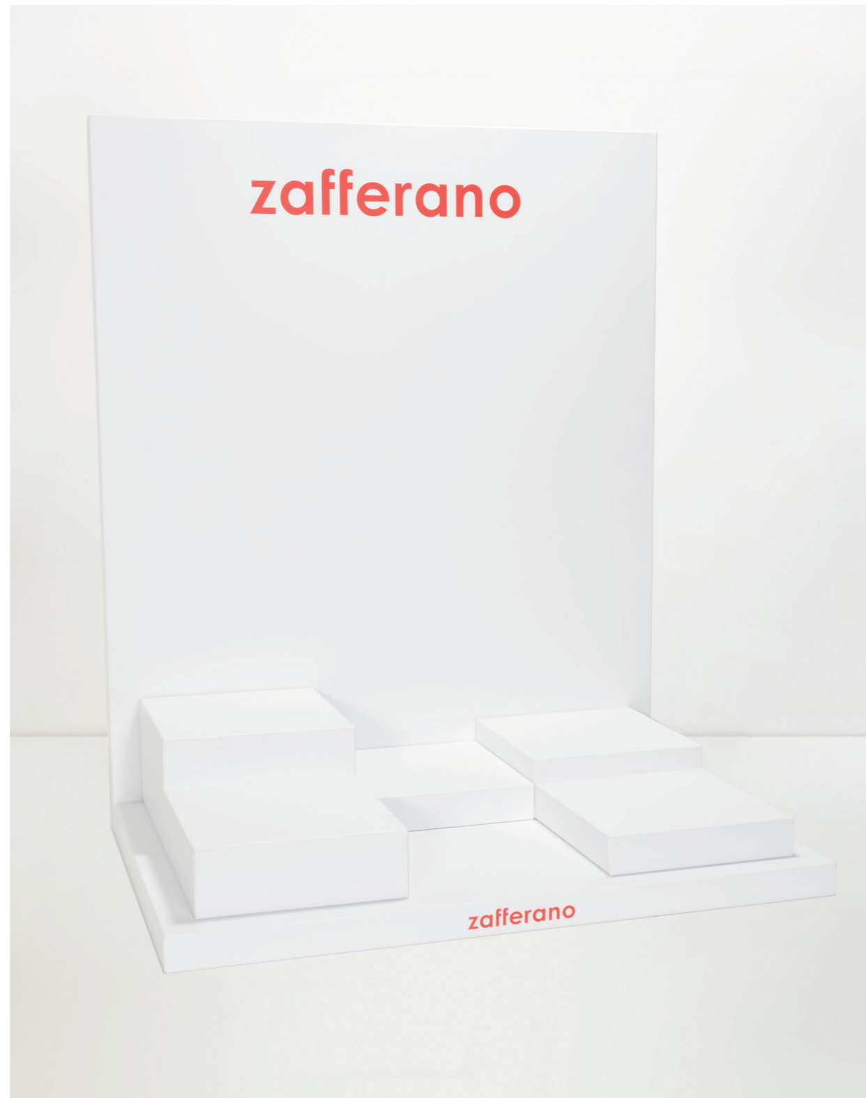
Visual - side 1

The display can also be used without the magnetic Visual Insert, ensuring maximum versatility.